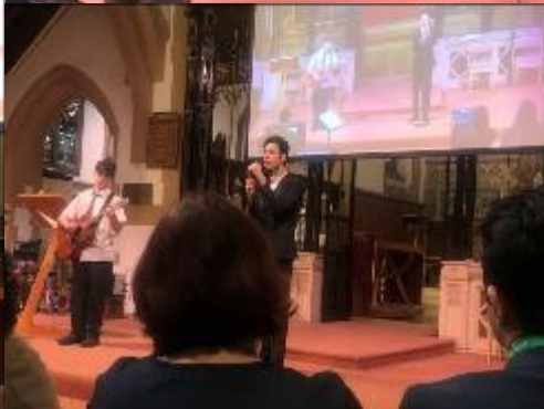
Church Assembly with awards given out, choirs singing and Year 11 reflections on their time at KHS...