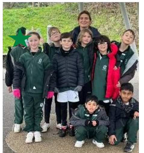
Year 4 had a super time at RHS Wisley's Rainforest Workshop this week!