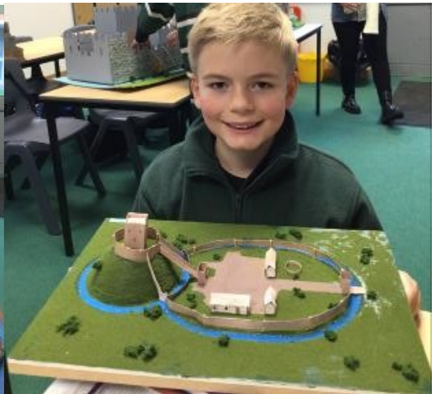
Castle Howard? No, Castle Kingswood!