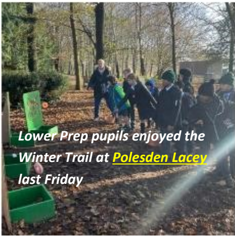
Lower Prep pupils enjoyed the Winter Trail at Polesden Lacey last Friday