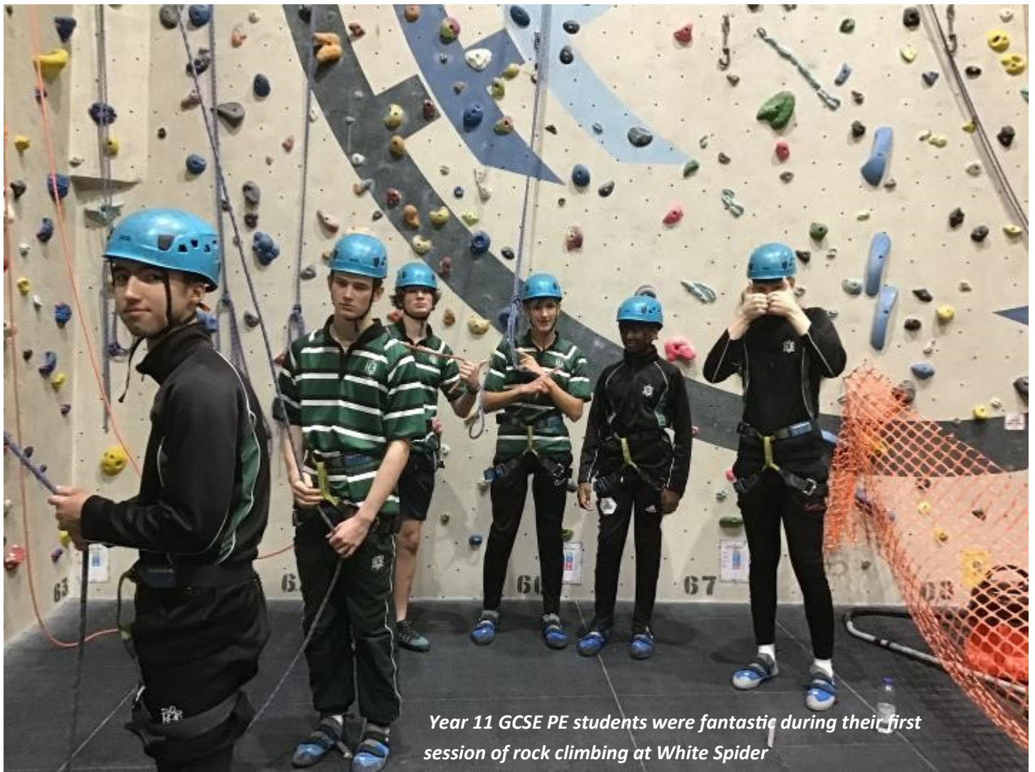
Year 11 GCSE PE students were fantastic during their first session of rock climbing at White Spider