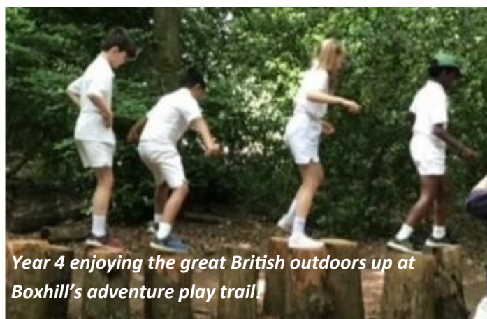
Year 4 enjoying the great British outdoors up at Boxhill's adventure play trail!