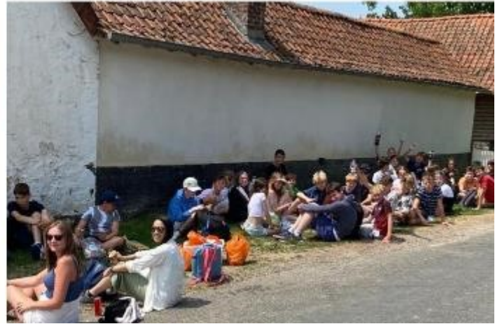
A day out at the Bagtelle amusement park and, on another occasion, petting goats, proved very popular with our pupils.