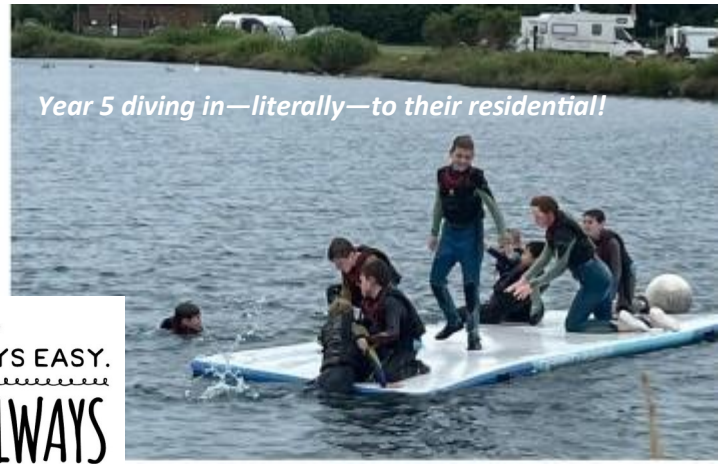
Year 5 diving in—literally—to their residential!

IT'S NOT ALWAYS EASY. BUT IT'S ALWAYS WORTH IT