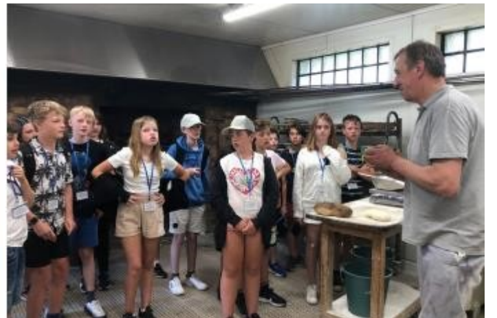
The Year 7 French trip have had a wonderful time doing all manner of activities this week from learning about traditional French baguette making and producing goats cheese, to enjoying the aquarium at Nausicaa.