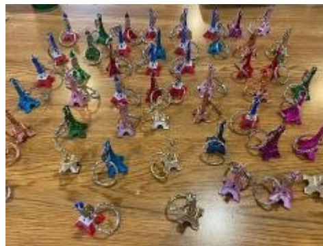
A tour of a biscuit factory and time for souvenir shopping were appreciated by all on the last day. Many thanks to all the staff who accompanied our pupils and a huge, 'Merci Beaucoup' to Monsieur Regeling for overseeing the trip.