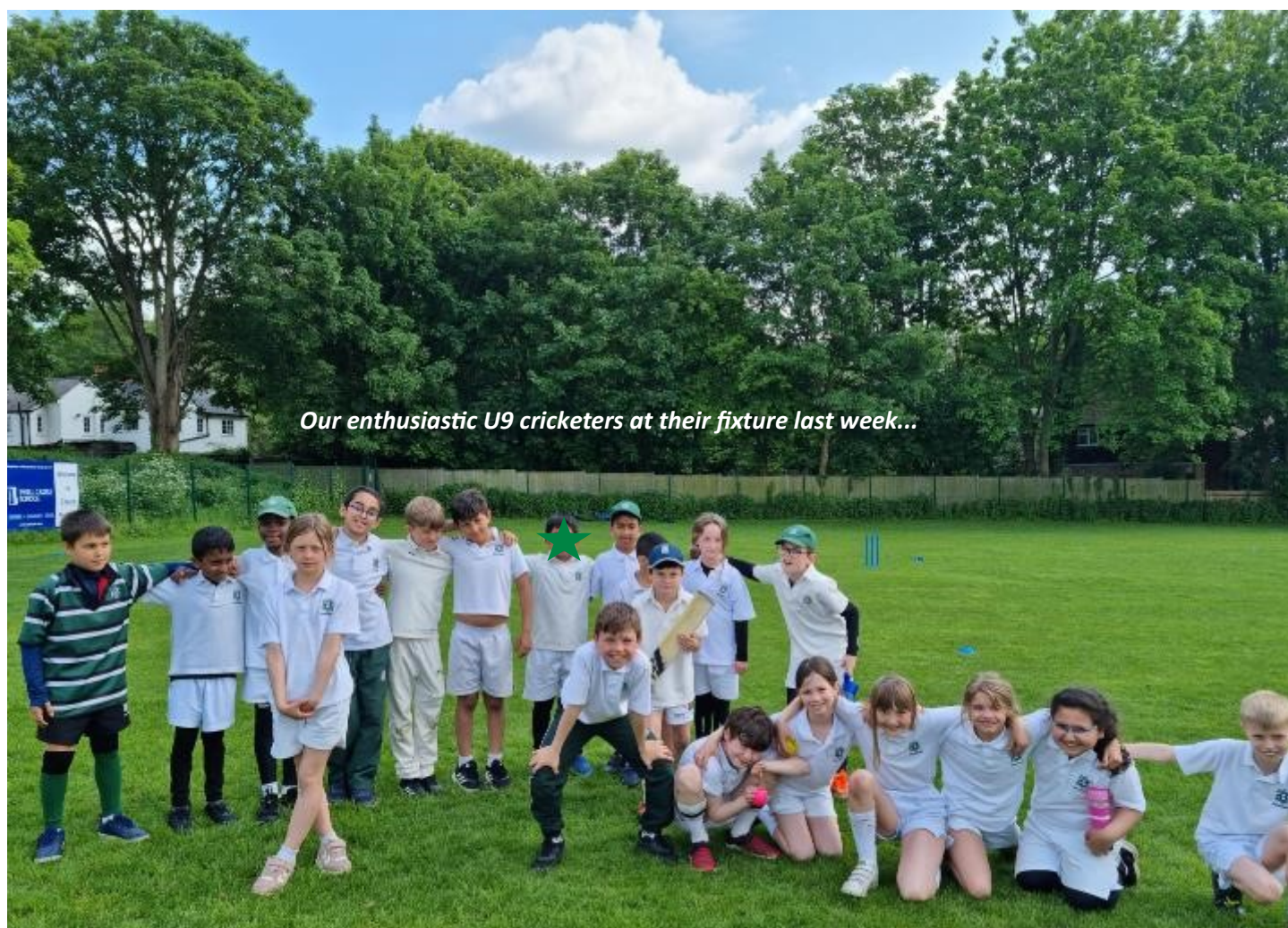
Our enthusiastic U9 cricketers at their fixture last week...

U13C boys won by 77 runs in their game—well played all! Mr Westcott