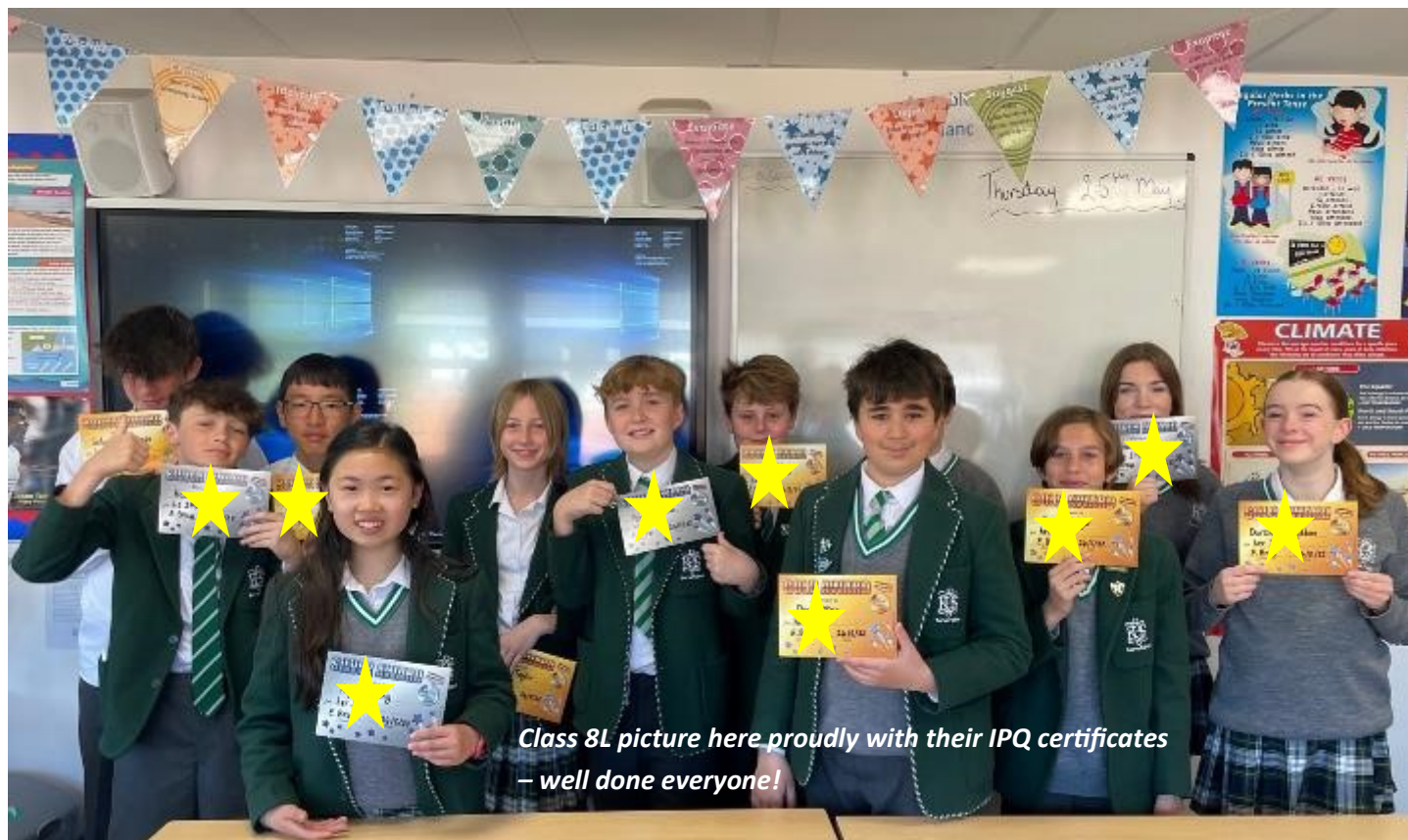
Class 8L picture here proudly with their IPQ certificates – well done everyone!