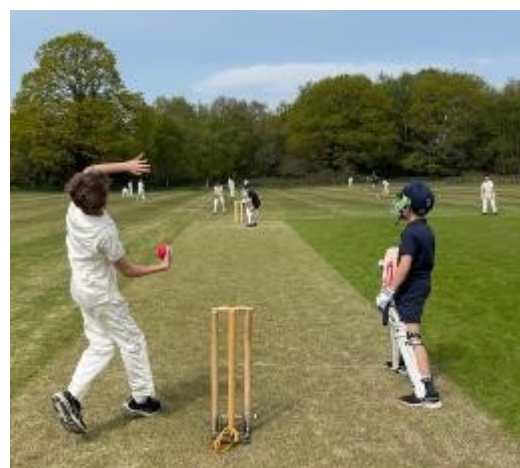
KHS Colts in action...