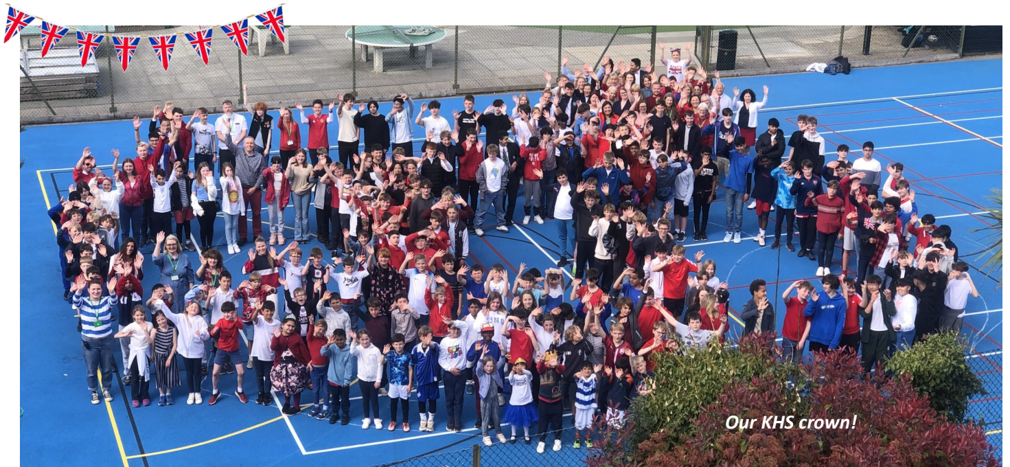
Our KHS crown!