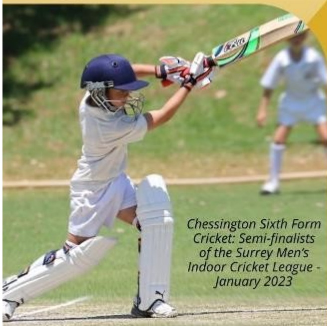
Chessington Sixth Form Cricket: Semi-finalists of the Surrey Men's Indoor Cricket League - January 2023