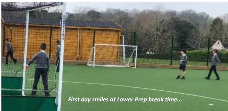
First day smiles at Lower Prep break time...