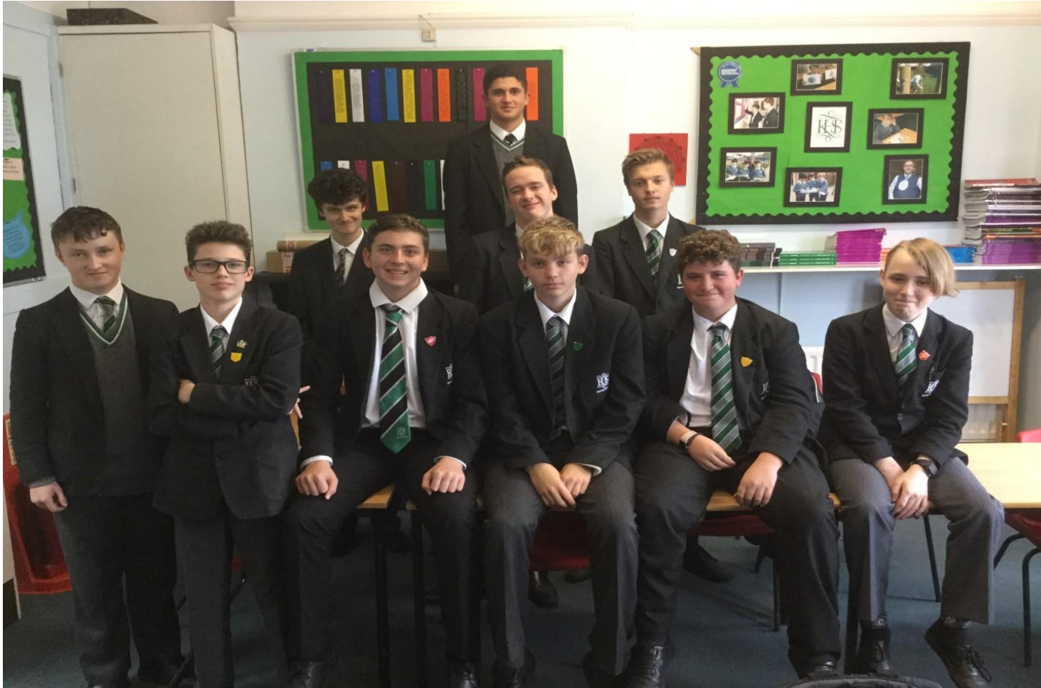
Kingswood House School